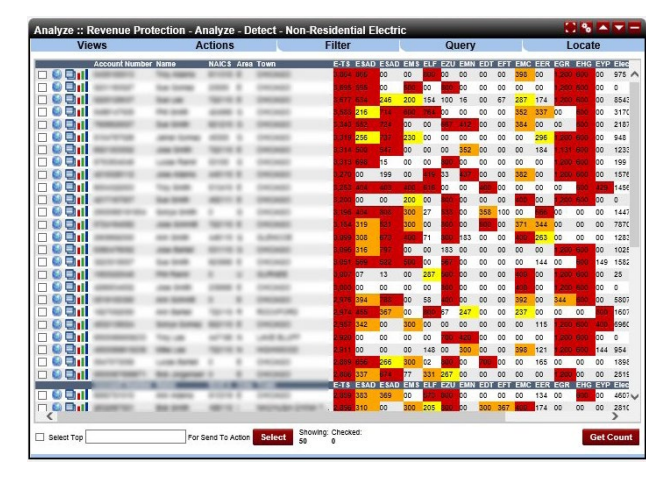
This example list view in the Revenue Assurance module shows the results of detection analysis by account.