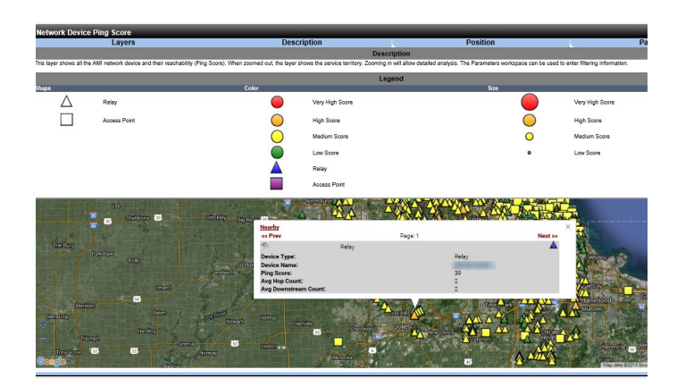
Ping scores are shown in this example map view in the AMI Operations module. Ping scores refer to the reachability of the Access Points and Relays in the AMI network.

Meter-to-Phase Connectivity: uses machine learning and AMI meter voltage data to identify the phase connection of each meter. Accurate phase connectivity enables efficient outage management, system planning, load flow calculations, phase balancing and many other critical grid management operations.